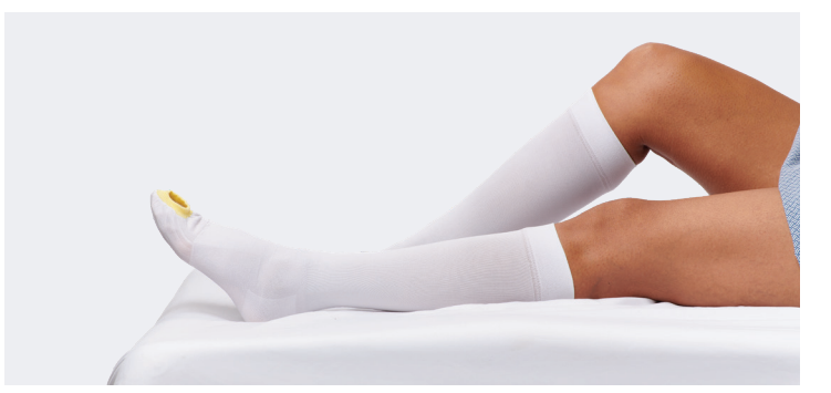
Adjust stocking at toes by gently pulling inspection window. Inspection window should be loose fitting. Check and adjust heel position.