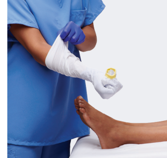
Grasp heel pocket. Look for the square. This is the heel pocket.