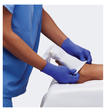
Place stocking on foot, stretching sideways, work stocking over foot until heel pocket is positioned over heel.