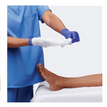
Pull stocking inside out until heel pocket is at the top of the opening.