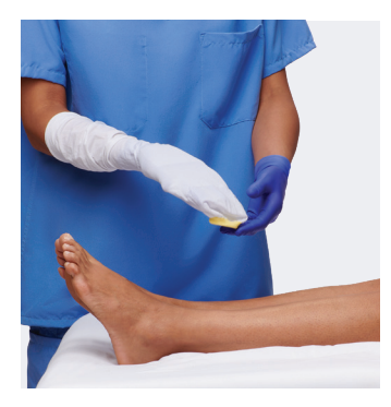
Reach into stocking.