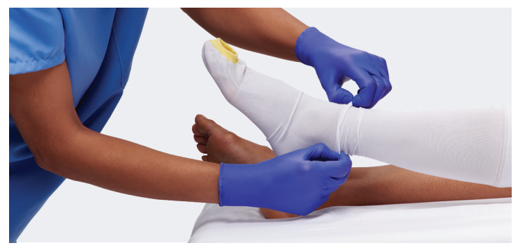
"Walk" stocking up leg with slight up and down rocking motion.