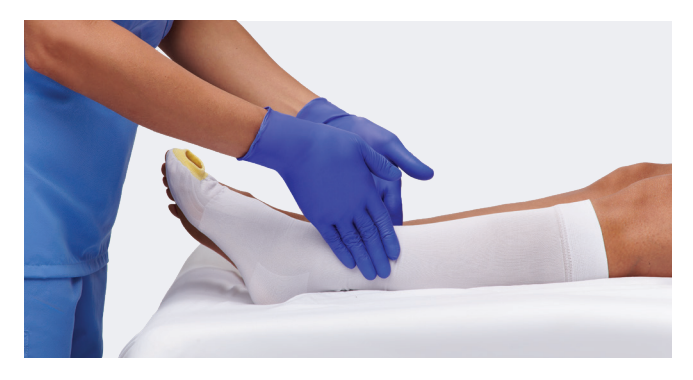
Distribute fabric evenly. Smooth out any rolls.